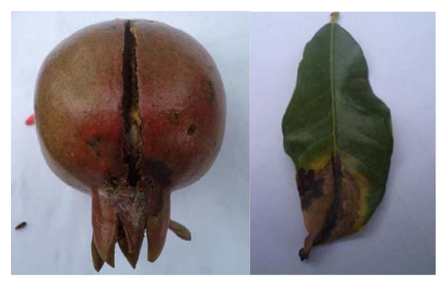
FIG. 1 BACTERIAL BLIGHT ON POMEGRANATE FRUIT AND LEAF

Automatic fruit disease detection system takes the input image and show the results directly to the farmer. But if the image taken by farmer having the poor quality in that case the results shown by the system may not be accurate. So we are adding Intent search technique into the system and will help to find the user intension of disease search. It will also help increase the accuracy of the system.